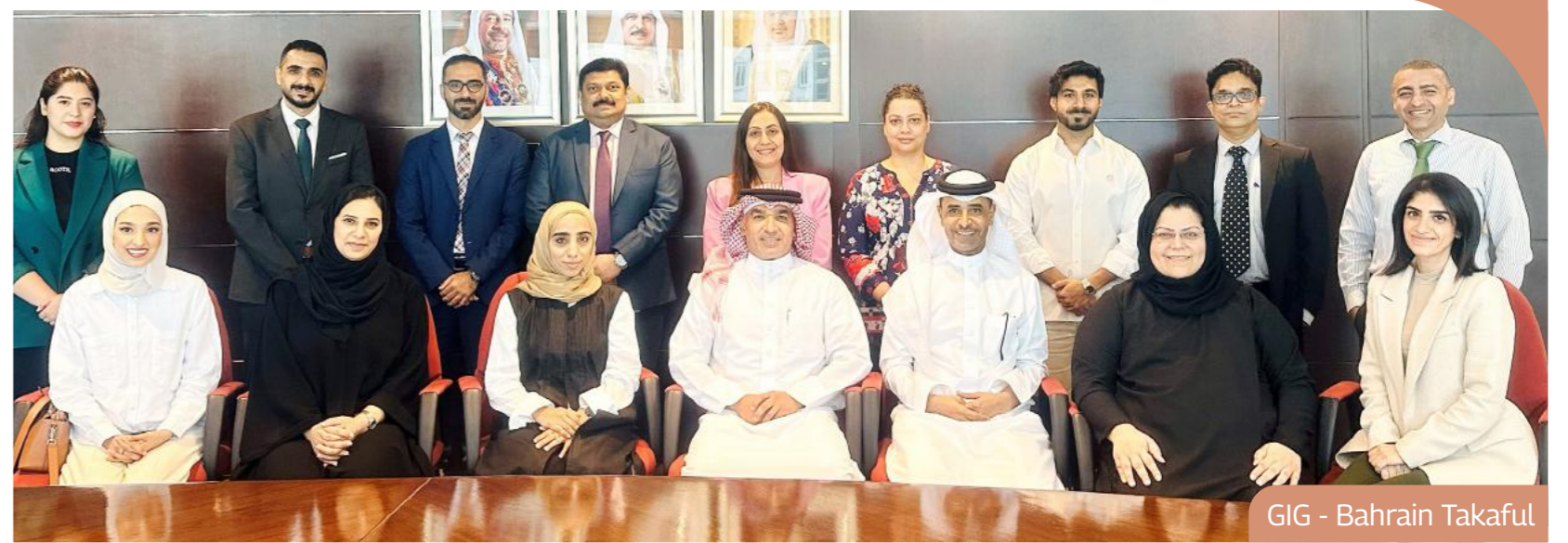
GIG - Bahrain Takaful