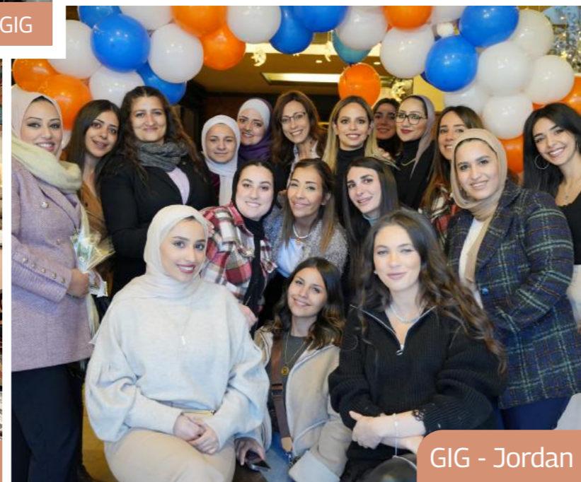
GIG - Jordan