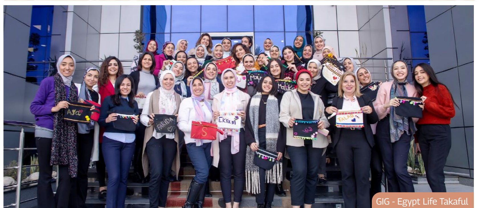
GIG - Egypt Life Takaful