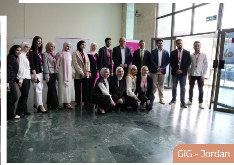
GIG - Jordan