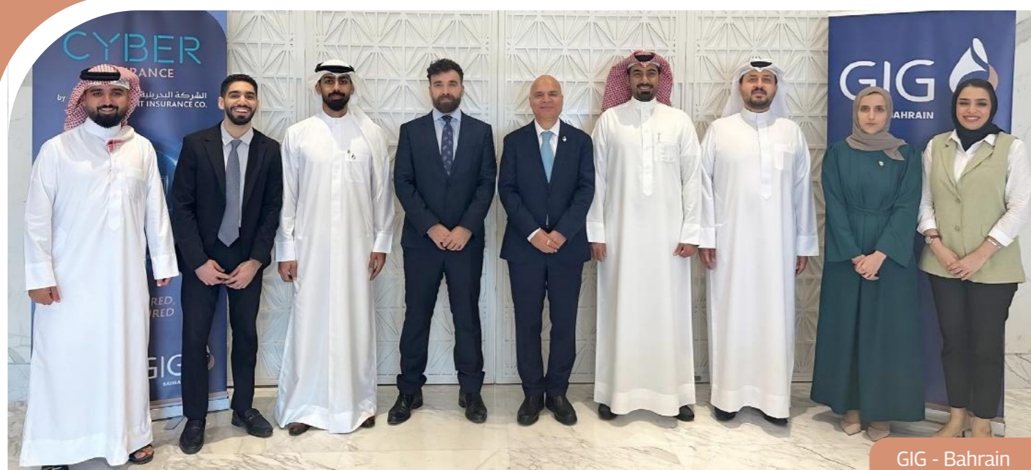
GIG - Bahrain

Participates in Cyber Security Insurance Workshop