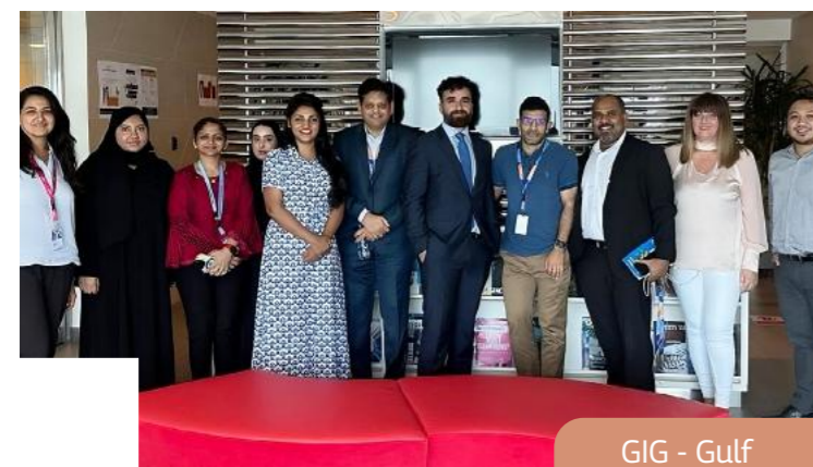
GIG - Gulf

and informative presentations that shed light on various aspects of cyber insurance, including policy coverage, risk assessment, incident response, and emerging cyber threats.