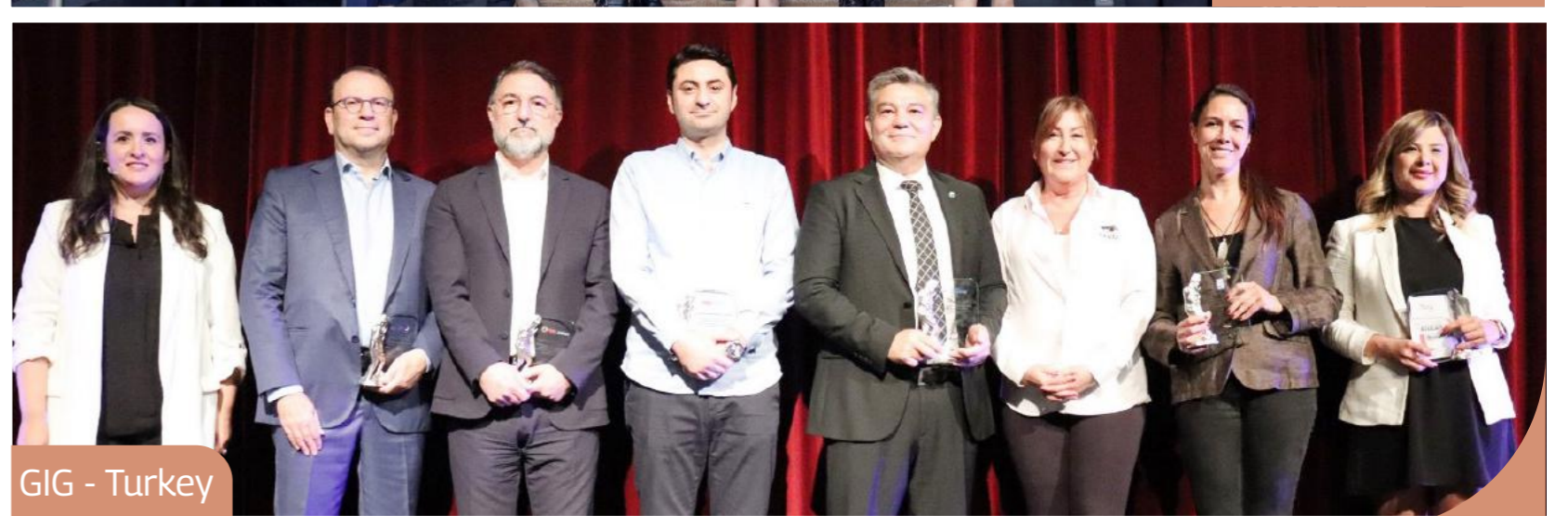
GIG - Turkey