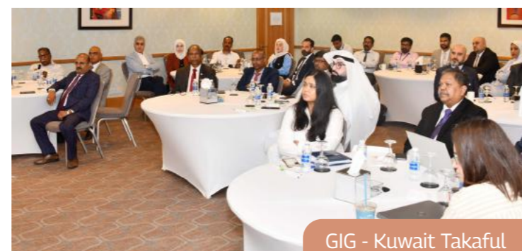
GIG - Kuwait Takaful